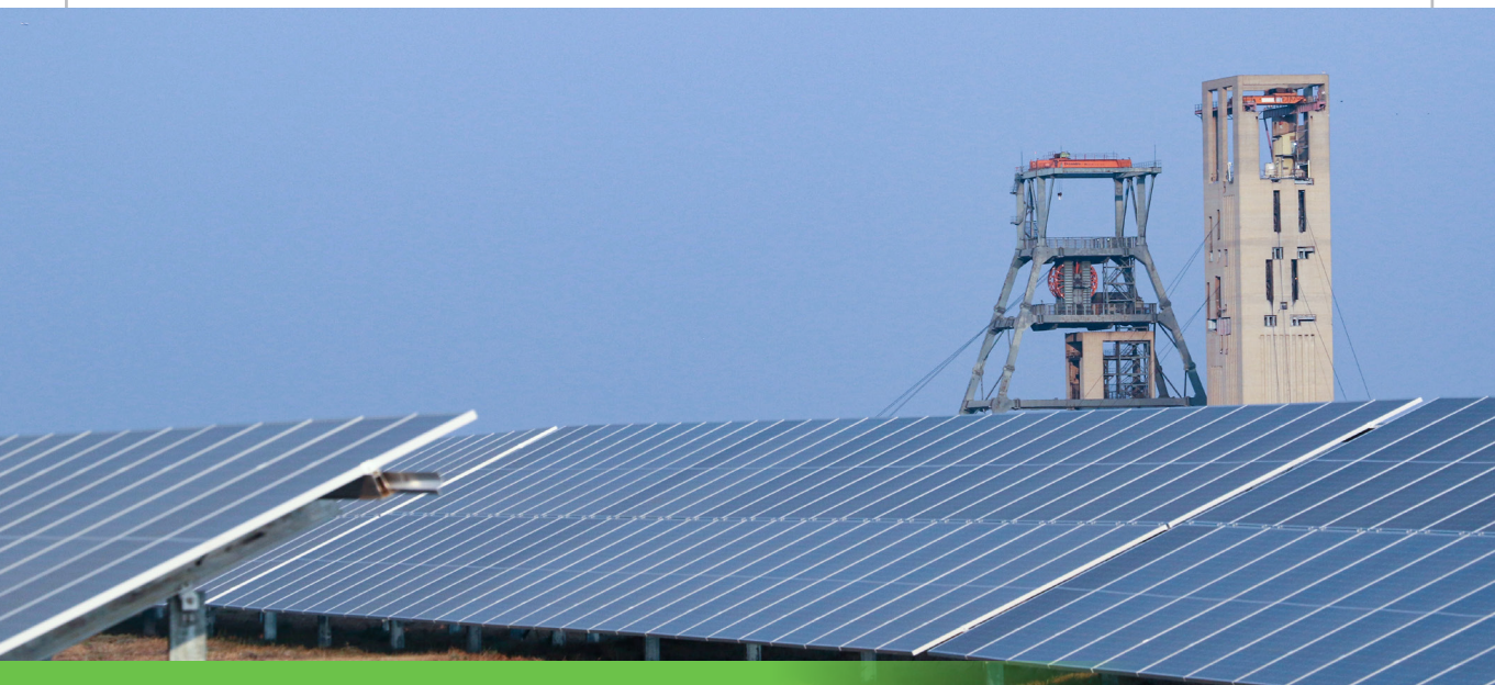
The South Deep solar plant is set to be fully commissioned next month.

Our Purpose Creating enduring value beyond mining